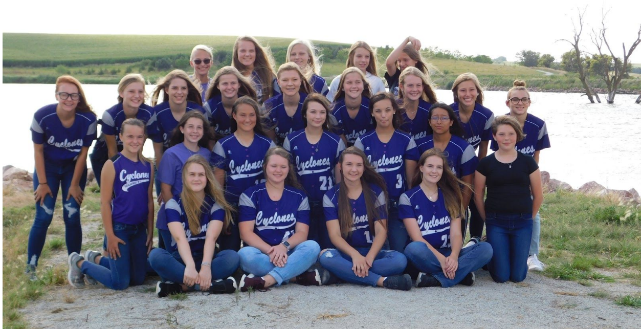
2019 HIGHWAY 91 SOFTBALL TEAM